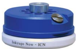
INK CUPS UNIVERSAL DESIGN