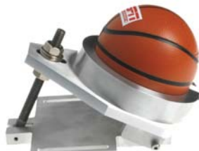
PARTS AND TOOLING