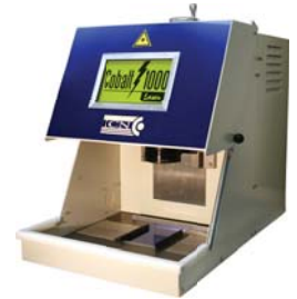
DIRECT TO PLATE LASERS COBALT 1000, COBALT 300