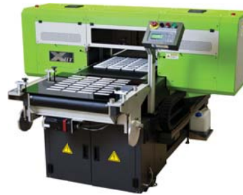
INKJET PRINTERS XJET, EdiJET & MIMAKI