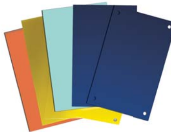
LASER PLATES COBALT, ACCULAZE & MORE