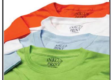
APPAREL TAG PRINTING TURNKEY SOLUTION