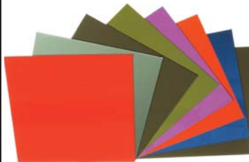
PHOTOPOLYMER PLATES ALCOHOL & WATER WASH