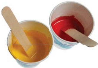
SAPPHIRE INK SERIES INK FOR PAD & SCREEN