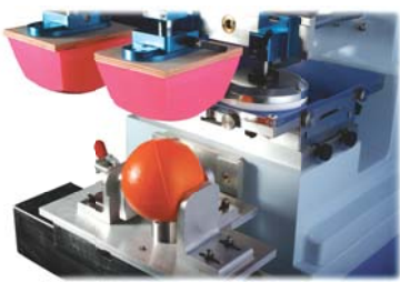
PAD PRINTERS B100, B150, 2200PS, 2500, 150