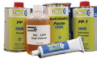
AUXILIARY SPECIALTY INK ADDITIVES