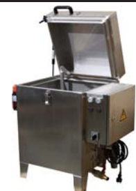
PART CLEANING SYSTEMS