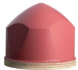
PRINTING PADS DIFFERENT STYLES