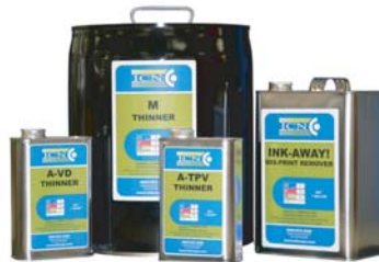
SOLVENTS FAST, MEDIUM, SLOW